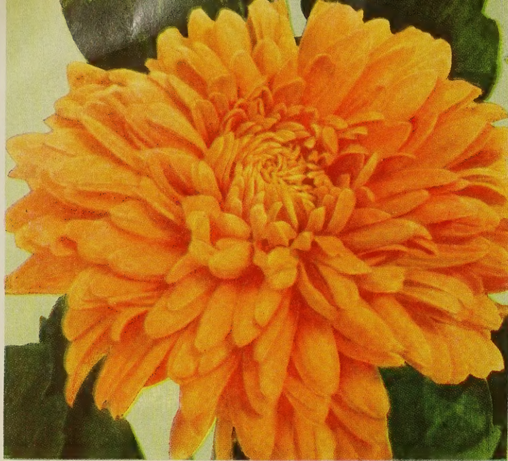
MOJAVE GOLD. $1.00 each; 3 for $2.50